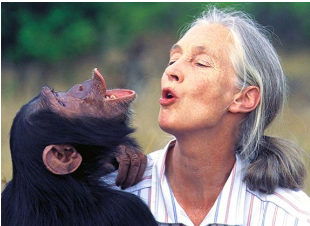
“What you do makes a difference, and you have to decide what kind of difference you want to make.”