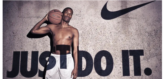
“Just do it” (Nike)