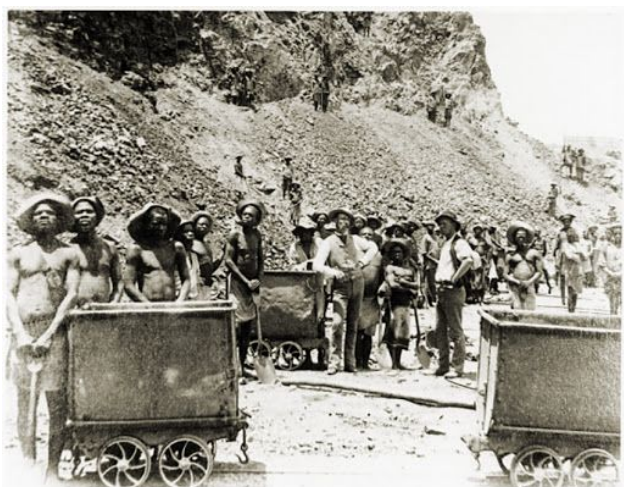
“A Diamond is Forever” (De Beers)