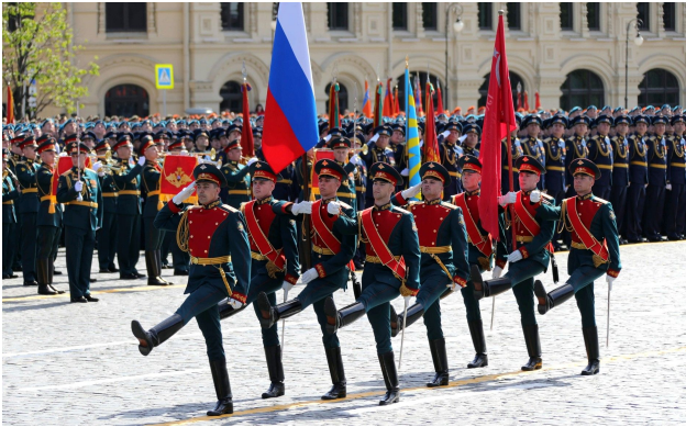
Flag, Fife and Drum, Sword (Any Nation)